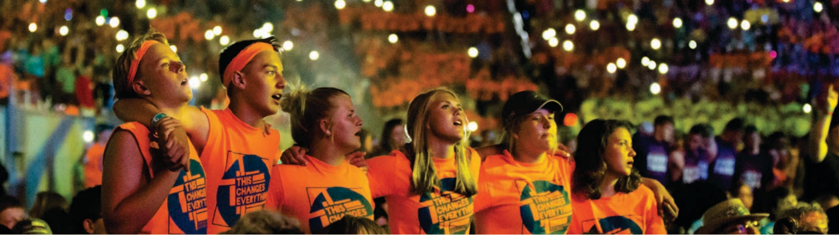
ELCA Youth Gathering